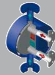
Plate & Shell, Fully Welded