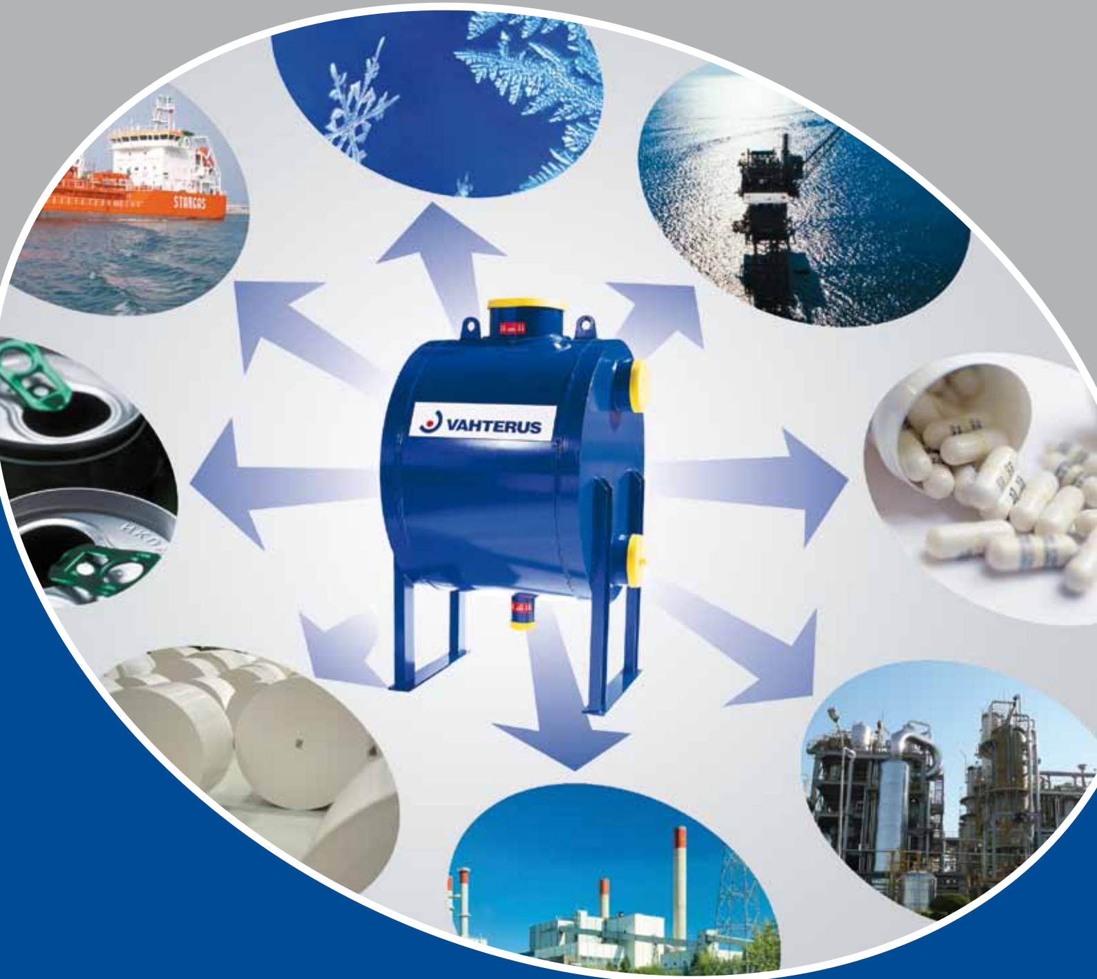
Plate & Shell

Vahterus Plate & Shell (PSHE) Heat Exchangers combine the benefits of traditional heat exchangers. Utilising a fully welded plate pack within a strong shell construction makes Vahterus PSHE the most compact, thermally efficient and cost effective