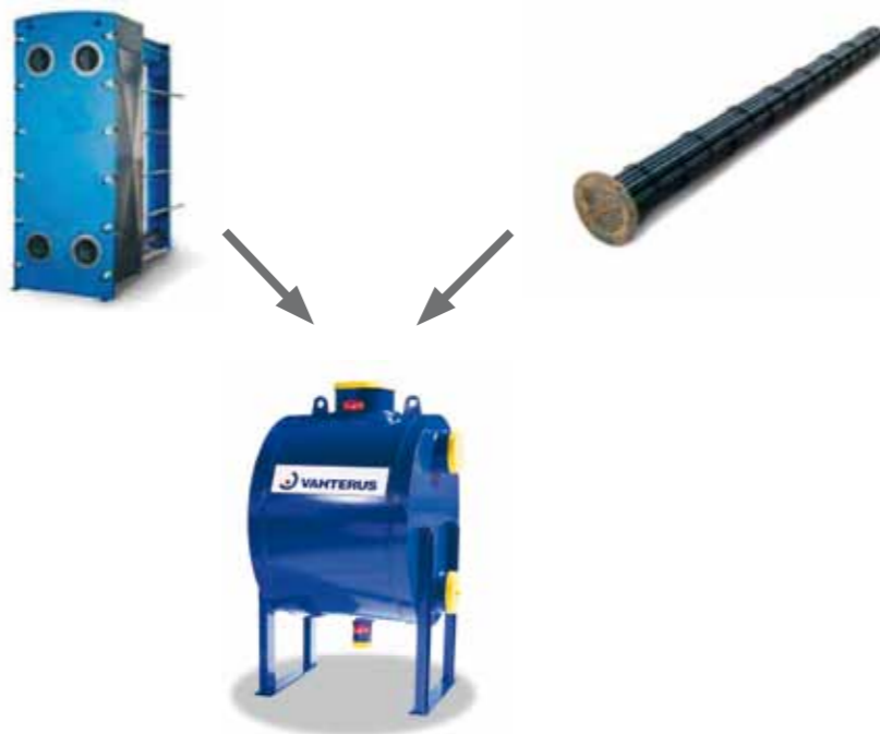
Plate & Shell