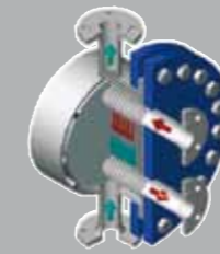
Plate & Shell, Openable